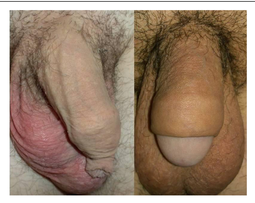
Fig. 1 Left, typical presentation of an excessive prepuce. Right, aspect of a circumcised penis: a residual portion of foreskin was left to cover the corona glandis when the penis was in a flaccid state.