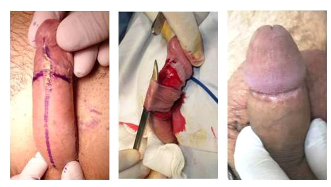
Fig. 2 Sequence of images illustrating our surgical technique. The frenulum and the penis raphe were demarcated. The proximal incision was made at the frenulum in figure of 'V'. The distal incision was performed very close to the corona glandis.

with 4/0 polyglactin 910 (Vicryl®, Ethicon Endo-Surgery, Cincinnati, OH, USA) and the skin by using 4/0 polyglactin 910 (Vicryl Rapide®, Ethicon Endo-Surgery) (Figs. 2 and 3). A compressive dressing was applied for 48 h. We prescribed 6 days of oral quinolones after surgery.